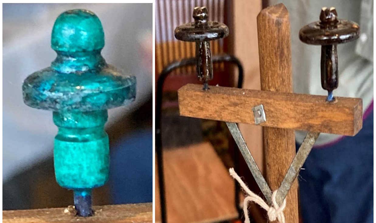
Miniature insulators on poles. For sale and made by Pat Miller

There were some interesting insulators at the table of Pat Miller that really weren't insulators. They were miniature reproductions of insulators attached to a replica of a utility pole. One pole had green transpositions on it and another pole had brown multiparts on it. Each insulator was no more than an inch tall. Poles were selling for $50 to $75 depending on the number of insulators and other features. On of the most expensive ones included a lineman. The pieces were all hand-made.